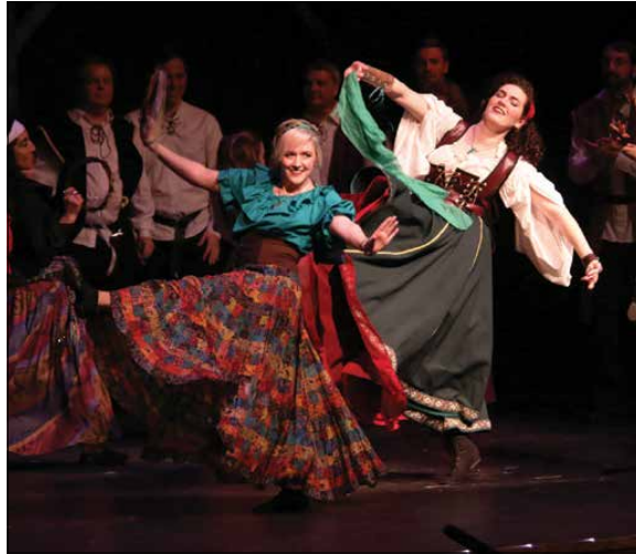
Gypsies dance during Topsy Turvy Day, part of the Verona Area Community Theater's performance of "The Hunchback of Notre Dame."

Contact Amber Levenhagen at amber.levenhagen@wcinet.com .